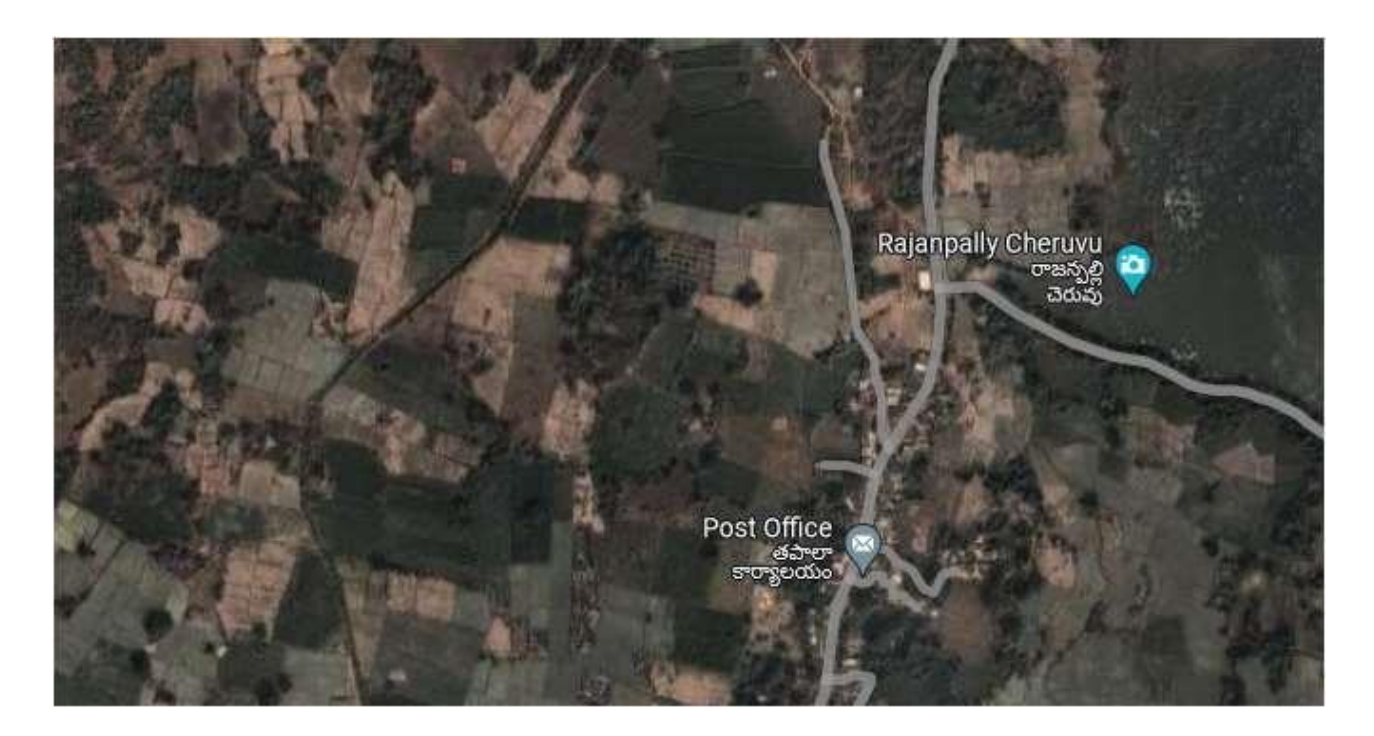
Figure-1. Study Area: Rajanpalle village, Gudur mandal, within Warangal district of Telangana, India

Monoliths measuring 25cm×25cm×30cm in depth were extracted by cutting down and digging with a spade. The soil was meticulously hand-sorted in a large tray, and soil arthropods were collected, euthanized, and preserved. The gathered organisms were preserved in a solution comprising 75% alcohol and 4% formalin (Bignell et al., 2008).