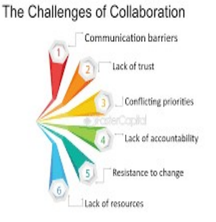
(Alrabadi et. al 2021).

Despite the benefits of participation between research facilities and pharmacy, the limited time also has numerous issues. Communication issues such as separation and substance contrasts can ruin data trade and supplier collaboration (Nanji et. al 2021). Furthermore, capacity imperatives, counting workforce and innovation limitations, may prevent the execution of collaborative measures. Overcoming these challenges requires progressing communication, authority back, and asset assignment to make strides in collaboration and maintain long-term partnerships.