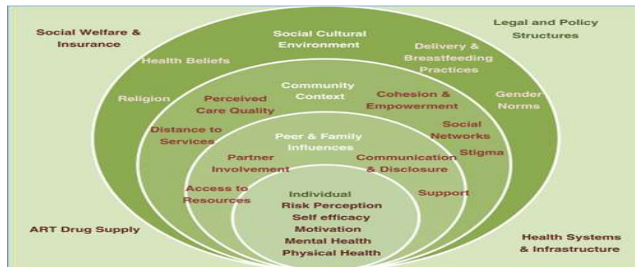
Figure 1. Social-ecological framework (adapted from Busza et al, 2012)

Likewise, research by Onono et al 6 , which found that barriers to HIV transmission prevention program services start from individual, family, community and structural determinants. The social ecological framework takes a broad view of health, focusing on the various factors that influence health. WHO, in line with developments in community and social epidemiology, has developed a social determinants of health approach which recognizes that the interaction of individuals, groups/society, physical, social and political environments influences health as recommended by Stokol. 7