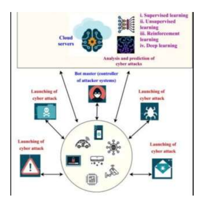
Figure 1.2: Cyber Incident Response and Recovery Implementation

Overviews and questionnaires are used to collect quantitative data in an organised manner from a variety of organisations and cybersecurity experts. In incident response, the recurrence and viability of the AI combination have been evaluated; this quantitative data is important. Measurable tools and techniques that provide intelligent data regarding the application and effects of AI provide a good foundation for analysing this data. The evaluation incorporates contextual analyses and meetings to enhance its subjective depth. Contextual evaluations of companies implementing AI-driven incident response frameworks provide believable experiences by identifying problems and potential fixes.