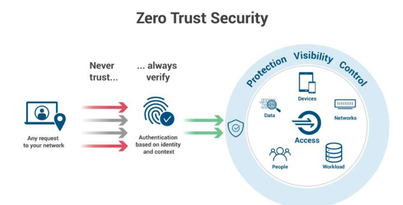
Figure1.1: Zero Trust Security

Choosing Strategies: Given the complexity of the topic "AI Improved Cyber Incident Response and Recuperation," a sophisticated approach ought to be used. Utilising quantifiable tools and techniques, data from reviews and questionnaires has been broken down to provide quantitative insights into the application of AI in incident response. In order to locate sporadic subjects and examples, topical investigation has been used to assess subjective data from contextual analyses and meetings. Leading investigations among ventures and cybersecurity subject matter experts should yield quantitative data on the productivity and recurrence of the AI mix in incident response. From top to bottom, contextual evaluations of businesses implementing AI-powered incident response frameworks provide insightful, subjective data.