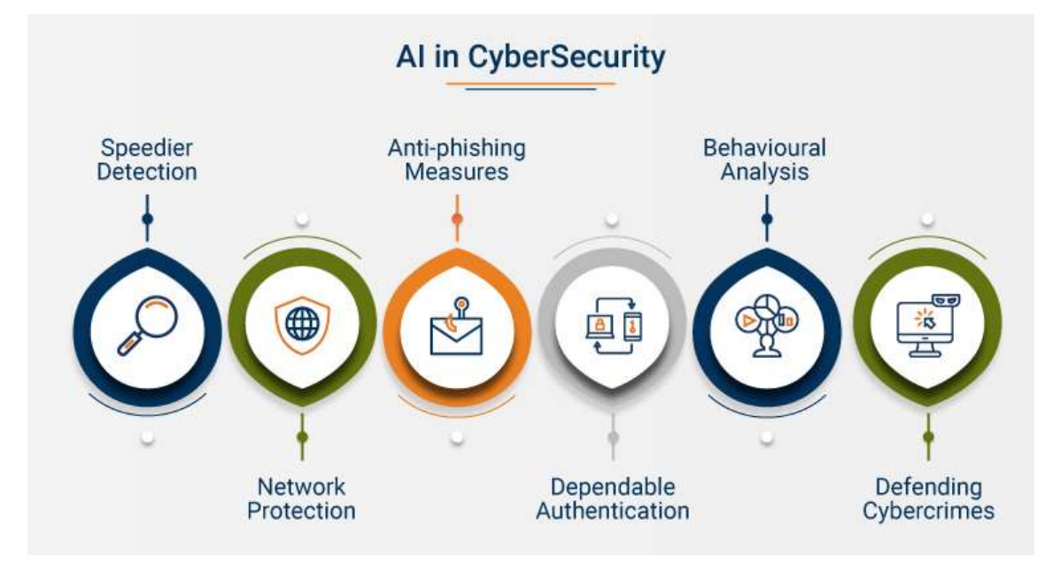
Figure 1.3: AI In Cyber Security

The evaluation primarily focuses on evaluating the effects of artificial intelligence (AI) innovations, such as machine learning and computerization devices, on the sufficiency and accuracy of various incident response and recovery operations. The application of AI has significantly accelerated the time it takes to identify risks. By using machine learning techniques, the framework can quickly identify anomalies in network traffic and system behaviour, which reduces the amount of effort needed to find possible threats. The reduction of the detection time helps the association respond more quickly to security-related issues. The use of artificial consciousness reduces false positives. By assigning more successfully, bogus positive assets are reduced, and cybersecurity organisations bear less needless obligation.