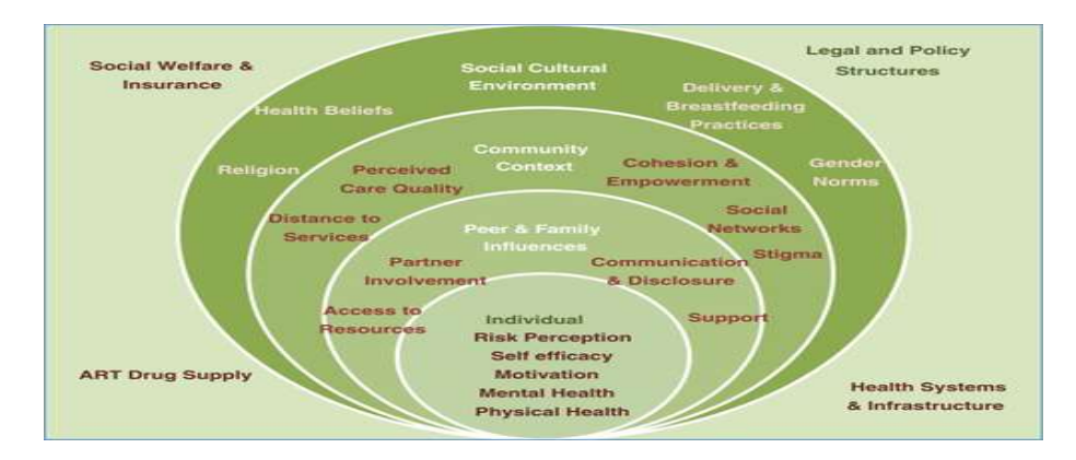
Figure 1. Social-ecological framework (adapted from Busza et al, 2012)

Likewise, research by Onono et al<sup>6</sup>, which found that barriers to HIV transmission prevention program services start from individual, family, community and structural determinants. The social ecological framework takes a broad view of health, focusing on the various factors that influence health. WHO, in line with developments in community and social epidemiology, has developed a social determinants of health approach which recognizes that the interaction of individuals, groups/society, physical, social and political environments influences health as recommended by Stokol.<sup>7</sup>