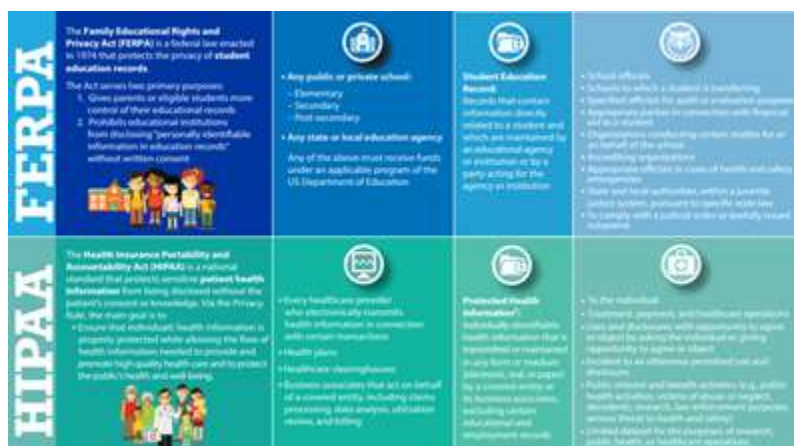
Figure: Health Insurance Portability and Accountability Act of 1996 (HIPAA)