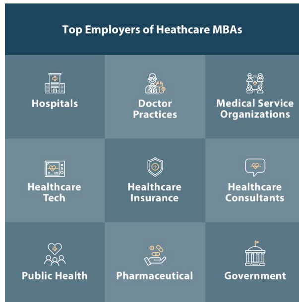
Figure : Incredible MBA Healthcare Administration Jobs