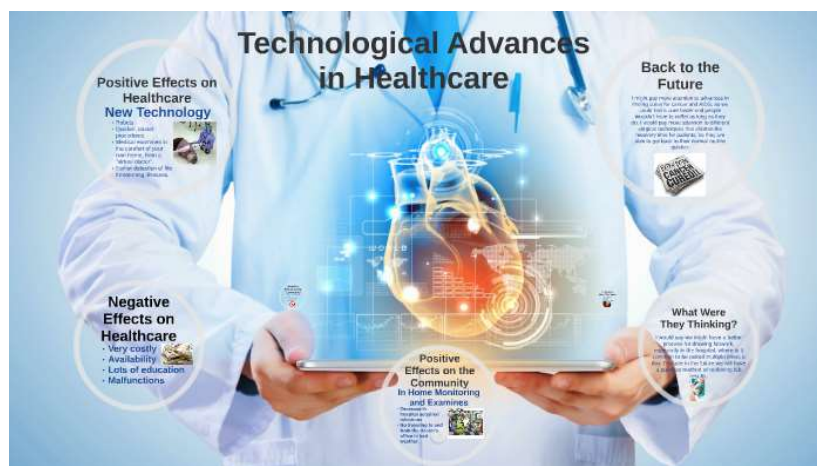
Figure: Technological Advances in Healthcare