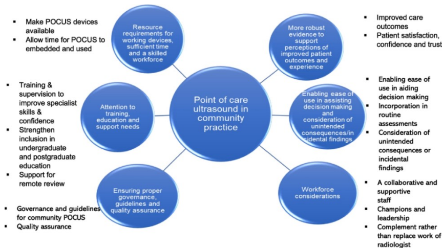
Figure 2: Challenges in Curriculum Development for POCUS Training